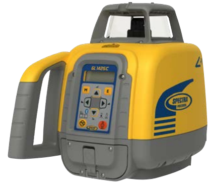
GL1425C features an enclosed lighthouse for superior ruggedness and environmental protection