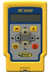
RC1402 Remote Control