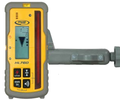
HL760 Digital Readout Receiver includes the C70 rod clamp