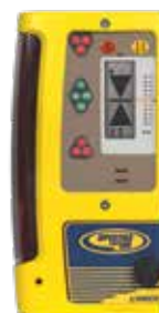
CR600 Combination Receiver includes the C50 rod clamp and C51 magnetic machine mount