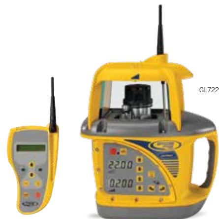
RC703 Remote Control