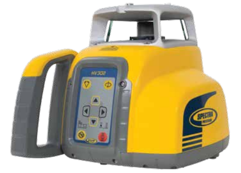
HV302 features a strong metal sunshade

(1) at 21° Celsius (70° F) (2) under optimal atmospheric circumstances (3) along the axis