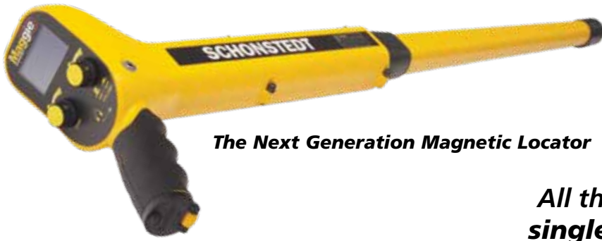
The Next Generation Magnetic Locator