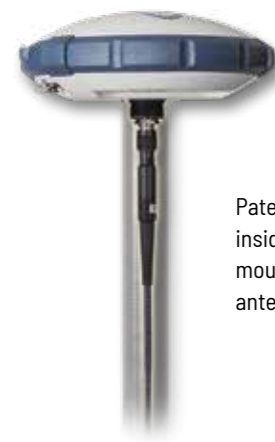
Patented inside-the-rod mounted UHF antenna design