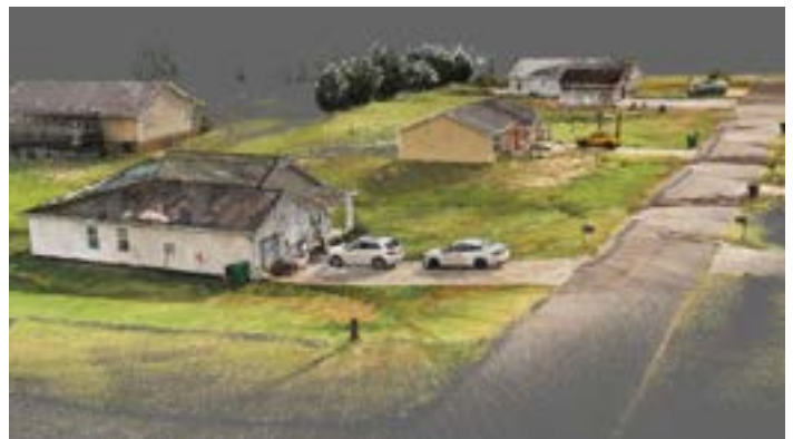
Figure 2 - Scan of rural street with houses