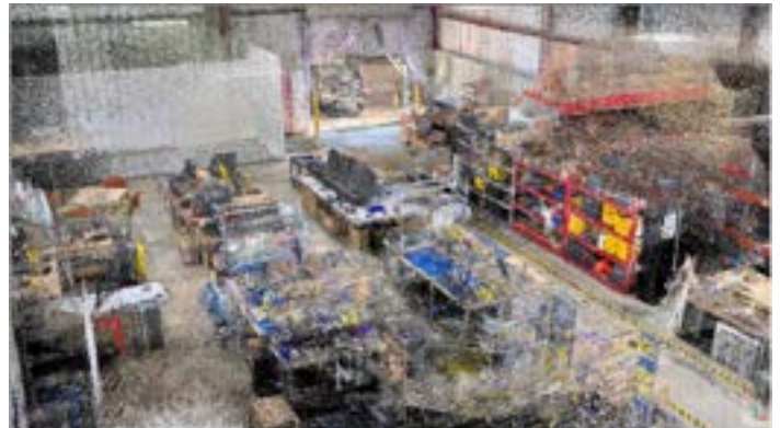
Figure 1 - Scan of the manufacturing area of GeoCue's Huntsville office